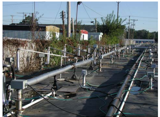
Residences Adjacent to Treatment Areas as Shown above on Site Map

and slower than expected heating rates. This required the installation of additional heater wells within the parking lot treatment areas. The additional heater wells were installed and made operational over a 14-day period with minimal disruption to operations. The target treatment temperature (210 °F) was achieved at locations in between the heater wells (i.e., the centroids) within 1 to 2 months following installation of the additional heaters. The guaranteed cleanup objectives were achieved 1 to 2 weeks following attainment of the target treatment temperature at the centroids. Soil temperatures in the immediate vicinity of the heater wells (e.g., 1-2 feet) ranged between 500 and 800°F (260 and 430°C) at the end of the heating period. The total treatment/heating time was 5 to 7 months.